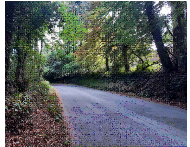
Existing view northwards towards hairpin bend