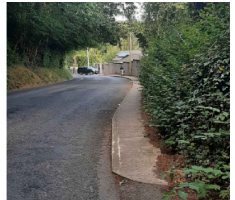
Existing view westwards of narrow footpath